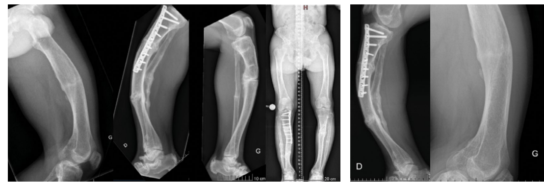
b February 2018