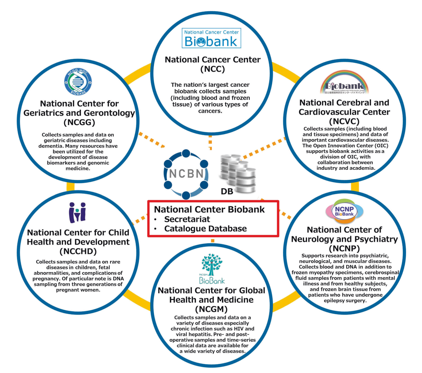
Fig. 1 Overview of the NCBN. The NCBN is a collaborative project by six national centers in Japan. National Center Biobank coordinates secretariat and catalogue database to promote medical research and development.