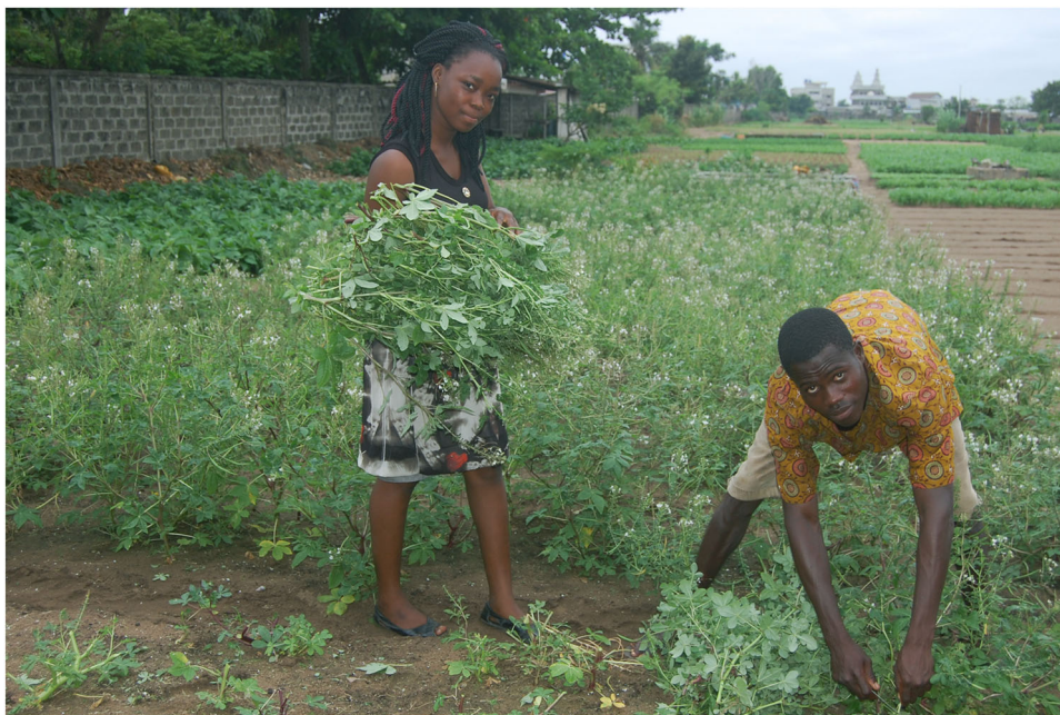
Fig. 2 Farmers harvesting Gynandropsis gynandra in a peri-urban garden (Benin)

variation in a wide range of metabolites. Analytical platforms include, but are not limited to: high performance liquid chromatography-photodiode array-fluorescence for apolar compounds (e.g., carotenoids, tocopherols, and ascorbic acid); liquid chromatography-mass spectrometry for semi-polar compounds (e.g., alkaloids, glucosinolates, flavonoids, and gallotannins); and gas chromatography-mass spectrometry for volatile compounds (e.g., amino acid derivatives, fatty acid derivatives, and terpenes). The results of such untargeted metabolomics methods may be combined with proximate and mineral analyses to finely characterize nutrient content variation in germplasm collections and guide selection. Results from such analyses will therefore provide rational nutritional targets in G. gynandra as well as a basis for meeting them. With proper passport data, intraspecific variation in metabolic profiles may also be linked with cultural and/or geographical information. Moreover, the discovery and identification of metabolites with health-promoting properties could motivate further pharmacological studies on the species and provide incentive for utilization of G. gynandra as a nutraceutical food. While there is available information on the nutritional value of orphan leafy vegetables 24,27 , such comprehensive analyses on natural variation in nutrient contents on wide germplasm collections are scarce and should be considered.