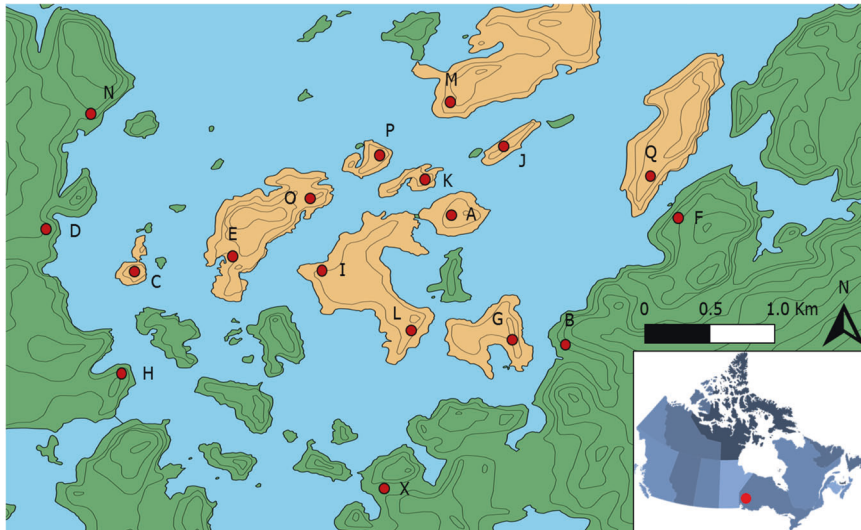
Fig. 1 Map of the Mikaki study area. Map of the Mikaki study area, north-western Ontario, Canada (red dot on a small map, bottom right), and of the study sites (A to X). Red dots on the large map represent the sampled sites. Sites N, D, H, F, B and X were located on the mainland and all of the other sites were located on islands. The islands that were sampled are in orange. Site M is located at the South end of a large island (3.164 km 2 ) that extends north. Map made with QGIS Girona 3.2.0.