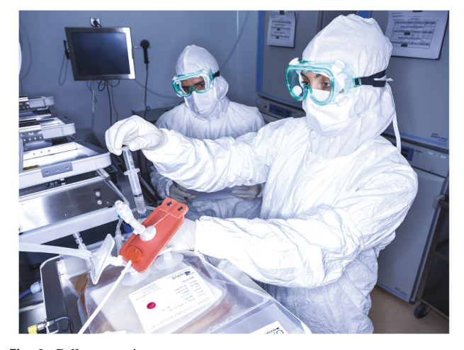
Fig. 2 Cell processing

The core of our Cell & Gene business strategy is to now bring tisagenlecleucel and other CAR-T therapies to as many patients who can benefit as possible. In collaboration with Penn, and the Children's Hospital of Philadelphia who