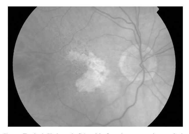
Fig. 1 Typical U-shaped GA with foveal preservation and the presence of dot RPD which are most prominent superotemporally, with an extension of the GA seen in that direction. The preserved fovea and surrounding retina, although not affected by the GA, has diffuse and widespread hyperpigmentary changes. The rim of the GA lesion has a cuff of hyperpigmentary changes. The U-shape of the GA mirrors that of the known topographical distribution of RPD in the fundus. Features of age-related choroidal atrophy, including peripapillary atrophy and rarefaction of the fundus are also seen, with few visible choroidal vessels between the optic disc and fovea. Outside the GA, there are no large drusen, but a predominance of RPD.

With multimodal imaging, GA is recognised as more heterogeneous than previously reported. Different phenotypes are described, including the 'diffuse-trickling' subtype identified with fundus autofluorescence (FAF) [22], which appears associated with reticular pseudodrusen (RPD) which are significantly associated with AMD [23–26]. Similarly, single round vs. multifocal lesions are described, whilst in subgroups of GA patients, coalescence of atrophic areas may form 'horseshoe', 'U' or later 'ring' configurations [5, 6] (Fig. 1). Foveal-sparing GA, with late central vision involvement has been described [3, 5, 6]. Xu et al. reported an almost universal presence of RPD in multi-lobular GA, with lobule enlargement into RPD areas [25].