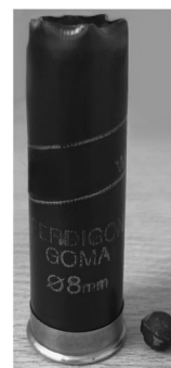
Fig. 1 KIPs with its cartridge. Each cartridge contains twelve 8mm baton rounds. The logo was removed using a photo editing software.

Table 1 shows the characteristics of patients by suspected cause of trauma. Patients with ocular trauma caused by KIPs were young (median age 26.3, interquartile range 22.0–31.4), more often male and from the Metropolitan Region. Cases were almost equally distributed among different categories of the public health insurance and also 11.5% had private health insurance. Thirty-three cases had total blindness and 90 cases (49.5%) had severe visual impairment or were blind at first examination (WHO categories 3 to 6). Around 20% of the cases caused by KIPs had open-globe trauma. Compared to other suspected causes of trauma, patients with trauma caused by KIPs were younger, more often