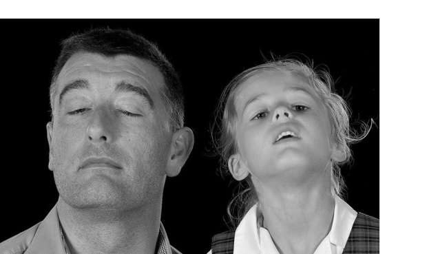
Fig. 1 A father and daughter with CFEOM type 1, both with ptosis and restriction of elevation of the eyes and a chin-up abnormal head posture

The cranial nerve abnormality is a primary innervation failure with an absence of normal innervation of the affected muscles where neurons fail to develop or are misguided. There may be a secondary aberrant innervation of the affected muscles by neurons of one of the other cranial nerves. As a consequence of reduced innervation, the affected muscles become atrophic and the unopposed action of other muscles results in fibrosis causing severe restriction of movement. The group includes congenital facial diplegia (CN VII), Moebius syndrome (CN VII and VI and associated horizontal gaze palsy), Duane syndrome (CN VI), congenital IVth nerve paresis and some cases of Brown syndrome (superior oblique tendon sheath syndrome) [5], Monocular elevation deficiency (superior division CN III), CFEOM (CNIII and occasionally CNIV) Marcus-Gunn jaw wink ptosis (CN III and CN V). Another related condition is horizontal gaze palsy and progressive scoliosis, a failure of crossing internuclear neuron development [6].