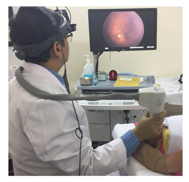
Fig. 1 Wide-field digital ROP screening by Retcam imaging

digital imaging cameras (Fig. 1). The ability of experts based in tertiary hospitals or reading centres to opine regarding treatment and follow-up based on images captured by trained technicians in mobile-screening teams has enabled provision of a large coverage of ROP-screening care in the community. The 'K.I.D.R.O.P' model [20] is an example of such a successful tele-screening programme in Karnataka (India) under private–public partnership which provides ROP screening in low-resource settings, remote centres and regions with few ROP specialists. An impact assessment of the image based tele-ROP programme in India showed that in the ten high-risk ROP states with a population of roughly 680 million, over 35,000 infants were detected with ROP and over 1200-needed treatment