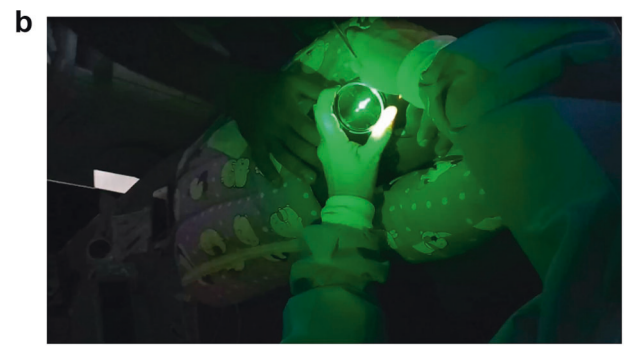
Fig. 2 a Indirect ophthalmoscopic examination with scleral indentation for ROP screening under topical anaesthesia. b Photoablation by laser indirect ophthalmoscopy using 532 nm green laser also under topical anaesthesia