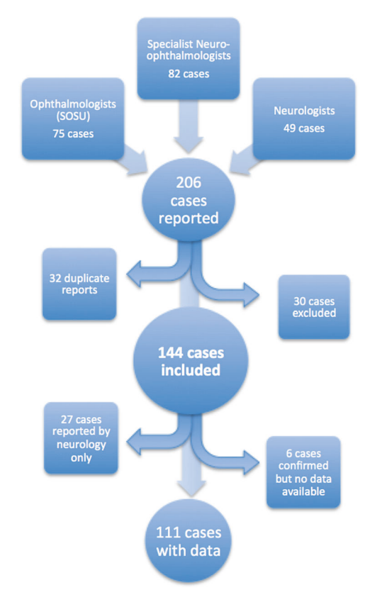
Fig. 1 Source of the reported new cases of IIH

The mean patient age was 27.7 years with a range of 6–63 years. One hundred and ten patients were female and aged 15–44. Eleven patients were under 15 (5 male and 6 female) and 12 patients were over 44 (2 male and 10 female) (Table 2).