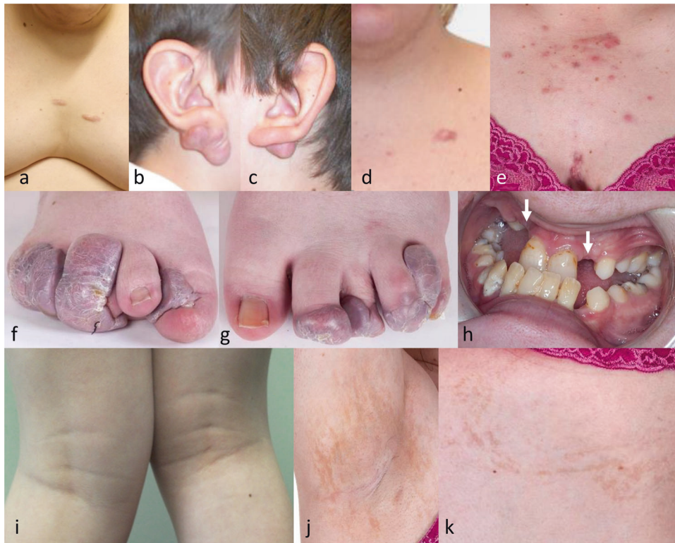
Fig. 2 Skin and dental features of patients with BFLS. Hypertrophic or keloid scarring on the chest of individual M2 (a), the ears of individual M10 (b,c), chest of individual M9 (d) and chest of individual F2 (e). Individual F2 had large fibromas grow from the nail beds of 8 toes (f, g). Dental examination of individual F2 (h) found a hypoplastic maxilla leading to a prognathic mandible and a range of dental anomalies including hypodontia, small widely spaced and irregularly shaped teeth, double talon cusps, dens invaginatus, and enamel hypoplasia. Teeth were removed due to compound composite odontomas (arrows). Steaky skin hyperpigmentation seen on individuals F1 (i) and F2 (j, k).