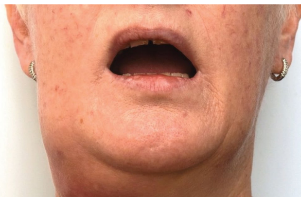
Fig. 1 Submandibular dental abscess