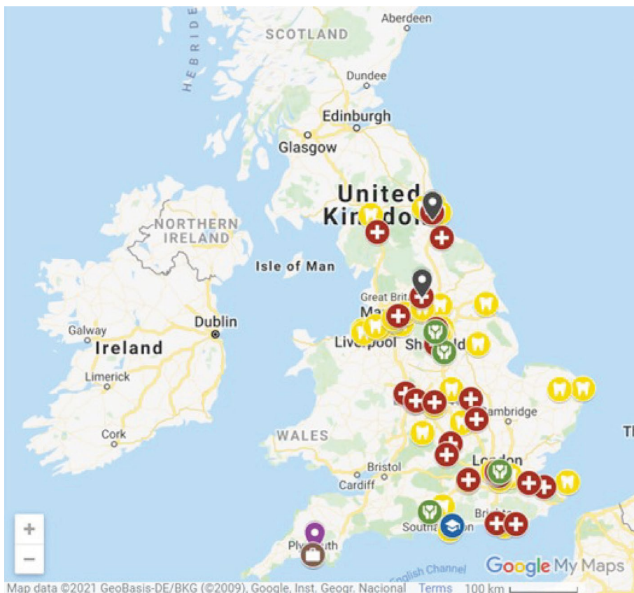
Fig. 3 Map of dental service types and location across England (key: tooth = general dental practice; cross = salaried primary dental care service; hands = third sector; purple map pin = social enterprise; mortarboard = university; briefcase = independent individual; black map pin = other)

(University 1). Conversely ‘making the right contacts’ (SPDC 10) and ‘targeting the right groups and engaging with the right staff’ (SPDC 17) were reported as facilitating access.