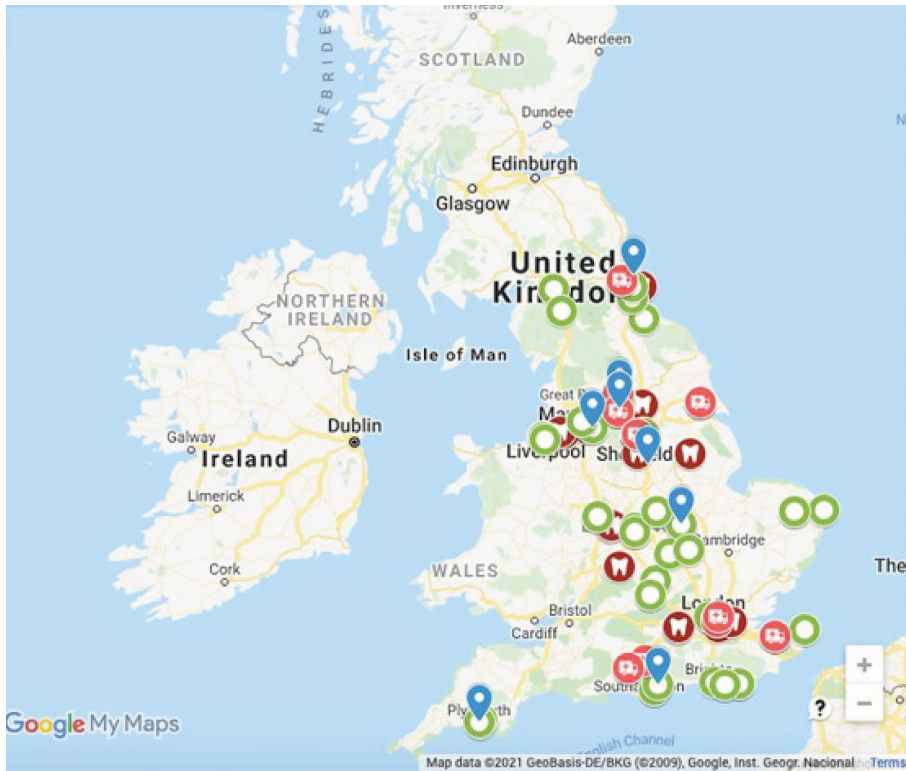
Fig. 2 Map of models of service and locations across England (key: tooth = fixed site dental services; ambulance = mobile dental service; circle = oral health promotion; map pin = other service type)