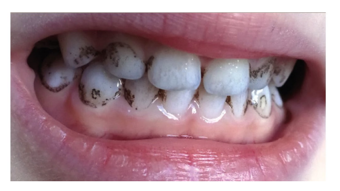
Fig. 1 Typical clinical presentation of black staining on a paediatric patient