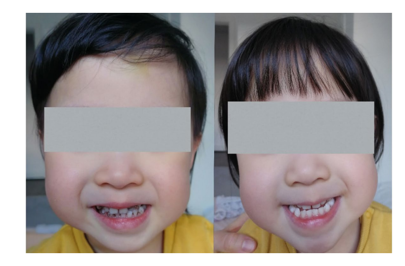
Fig. 4 Black stain seen on teeth of only one of two monozygotic twins (left)

Black stain is a form of extrinsic stain and is a commonly occurring dental problem. Correct diagnosis of black stain is essential to ensure the appropriate advice is given and subsequent treatment for this extrinsic staining. It can