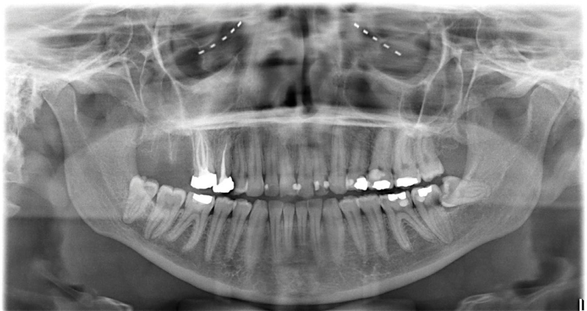
Fig. 2 Full OPT taken post-operatively