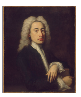
Fig. 1 Alexander Pope (1688–1744). Painting attributed to Jonathan Richardson, Museum of Fine Art, Boston, USA. Public Domain.

My favourite haematological oxymoron is 'Autologous Bone Marrow (or mobilized peripheral blood) Transplantation (ABMT)'. The preferred term is autografting but it seems that Autologous Transplantation has won out and is here to stay. For patients who were deemed to be too old for Allogeneic Stem Cell Transplantation (HSCT) or who did not have a donor, the use of autografting