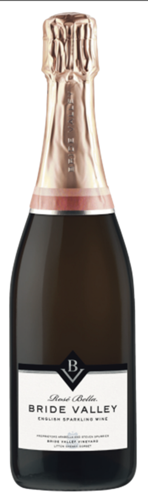
Fig. 3 A bottle of Bride Valley sparkling wine. A bottle of Rosé Bella English sparkling wine. Bella was Steven Spurrier's wife.

seemed to be a reasonable alternative to HSCT in so far as it would facilitate the administration of high-dose chemotherapy, with or without Total Body Irradiation (TBI), followed by 'rescue' with the administration of the patient's cryopreserved bone marrow. This procedure allowed high doses of chemotherapy to be used and the problem of graft-versus-host disease (GvHD) was avoided.