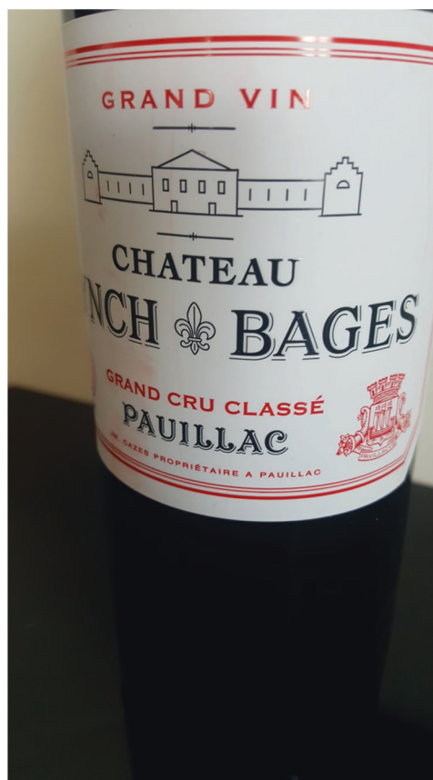
Fig. 2 A bottle of Chateau Lynch-Bages 2005. It was a present and we kept in a temperature and humidity-controlled environment for 10 years. We drank it during the lockdown. It was beautiful.

If you think you are experiencing difficulties in going to your local wine merchant or supermarket in these COVID-19 times spare a thought for Jefferson who had to worry about shipwreck, poor temperature control during shipping, piracy and adulteration when he imported wines to America.