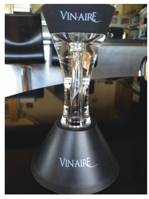
Fig. 2 Wine is poured through the device to allow it to mix with oxygen. Vin-Aire used for aeration of red wine before drinking.

O_2 added to the fermenting must (freshly crushed grape juice that contains the skins, seeds, and stems of the fruit) helps to limit the harmful effects of H_2S by raising the 'redox potential' of the wine (balance between H_2S and available O_2 ). O_2 can also help to stabilise the colour in red wine and to make tannins more rounded. It is up to the winemaker to decide which technique of adding O_2 to use to integrate into the vineyard's fermentation process. The level of free H_2S in a wine or must does not keep a wine from