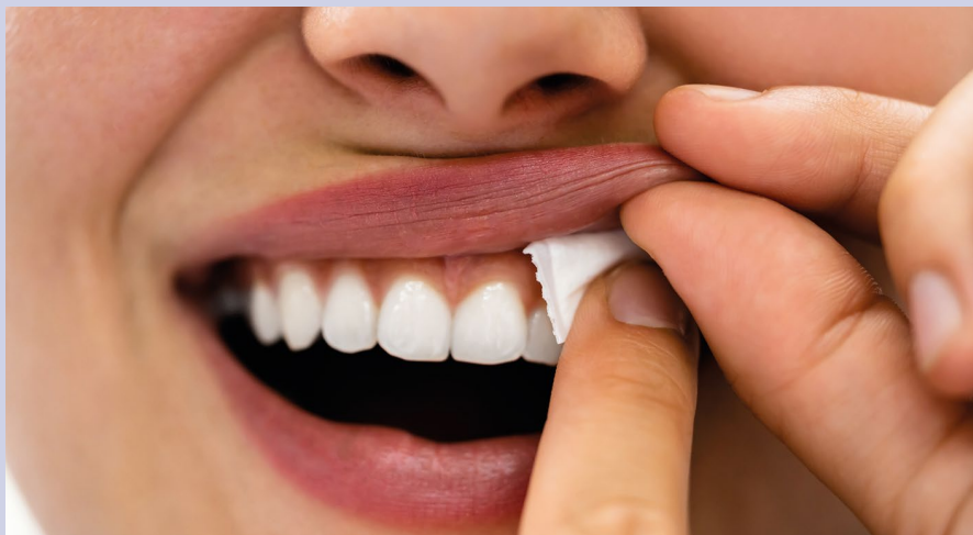
Fig. 1 A nicotine pouch being inserted into the bucco-labial sulcus.