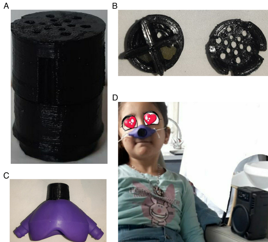
Fig. 2 Aromatherapy and music application. Modified nitrous oxide nasal mask, (A) 3D printed box, (B) placement of the cotton balls inside box's cavities, (C) the modified nasal mask after the 3D printed box was patterned on its circle hole, (D) A child inhale the aromatic oils from the modified nasal mask and listening to music from a speaker.