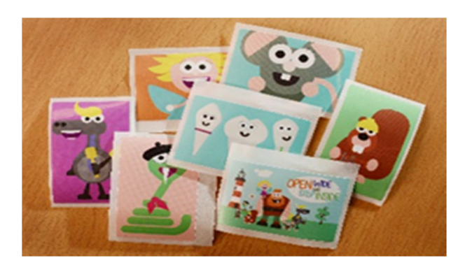
Fig. 1 "Open Wide and Step Inside" resources

The programme has a targeted design working with schools in the most deprived wards of the city (based on the Index of Multiple