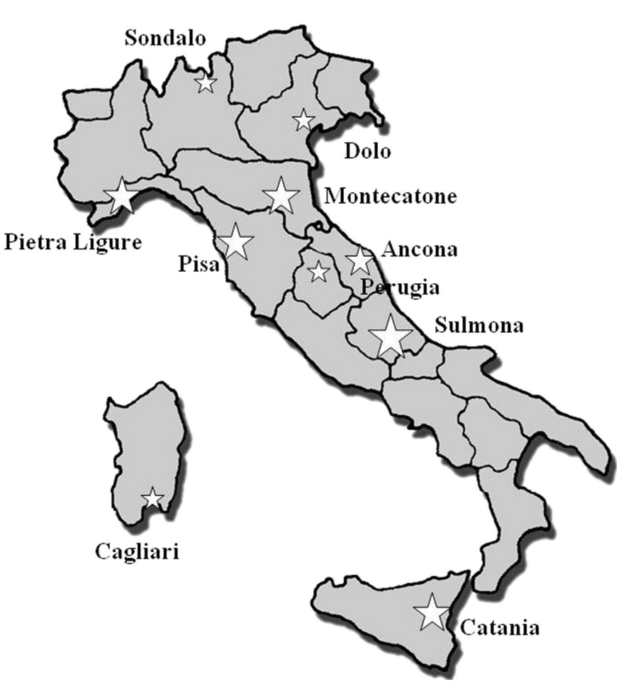
Fig. 1 Location of the Italian Hospital Spinal Cord Centre participating. Each star represents one participant centre; the star sizes are proportional to the sample size of persons examined in the hospital centre.

nociceptive [https://www.iscos.org.uk/international-sci-pain-datasets]. Only in some cases spasticity results in being painful and the mechanisms of pain perception in spastic muscle is not clarified [13].