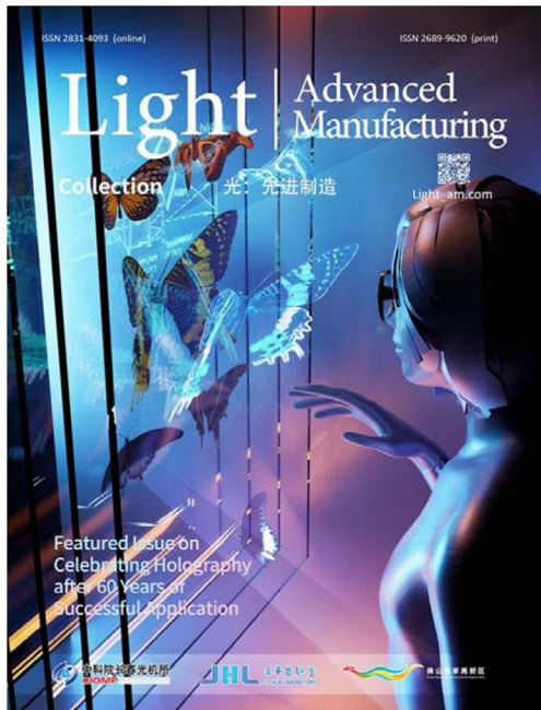
Cover of Featured Issue on Celebrating Holography after 60 Years of Successful Application

Further everlasting requirements from the industry are increased robustness against environmental disturbances, improved user-friendliness and resolution, and the performance for studying volume scattering and translucent materials. There is a nice recent publication where a lot of future activities are listed 5 . The fulfillment of all these wishes provides enough material for future research.