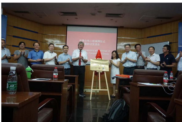
Opening of the Joint Shenzhen University and Stuttgart University Research Center for Computational Imaging supported by the Chinese Science Foundation and the German Research Association in 2018

Q5. According to the European Union Industry 5.0, the new concept of Industry 5.0 provides a vision of industry that aims beyond efficiency and productivity as the sole goals and reinforces the role and the contribution of industry to society. How will it change or affect our lives?