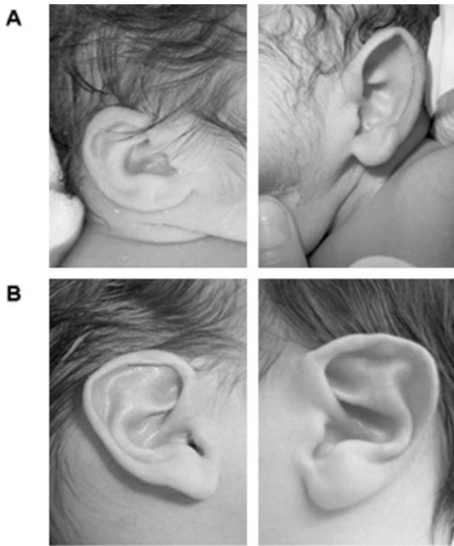
Figure 2. Typical examples of asymmetric ears in the newborns. A, B: Newborns presenting asymmetric ears. Both from the E group.

Tension measurements on intact tissue. The UCA rings from the E group presented contractions that were significantly lower than those from the NE group (Fig. 3). To investigate whether endothelial products could be responsible for these observations, we repeated the experiments in the presence of 0.1 mM N(omega)-nitro-L-arginine methyl ester (L-NAME) and 10 μM indomethacin, inhibitors of the release