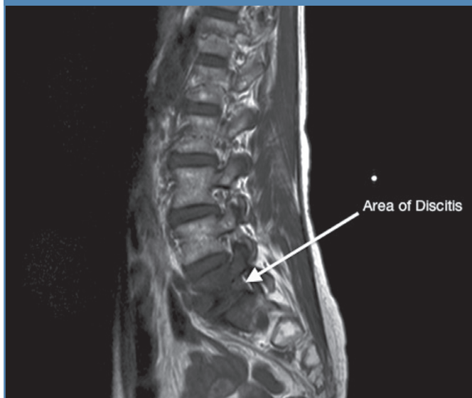
Figure 1. Lumbo-sacral spine X-ray showing discitis at L5/S1 level