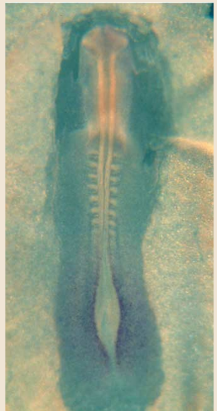
At embryonic stage 10 in the chick, Wise RNA (dark punctate staining) is expressed in the surface ectoderm from the level of the presomitic mesoderm to the posterior end of the embryo.

ORIGINAL RESEARCH PAPER Itasaki, N. et al. Wise, a context-dependent activator and inhibitor of Wnt signalling. Development 130 , 4295–4305 (2003)