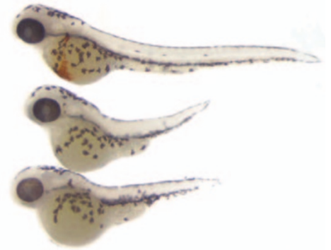
A wild-type embryo (top) and two embryos that have been injected with the TRAIL homologue D11b (bottom); all three have been stained to show that red blood cells are lost upon D11b overexpression.

In contrast to the intrinsic apoptotic pathway, which exists in all metazoans, the extrinsic pathway is a more recent evolutionary development. For example, no tumour-necrosis factor (TNF) proteins have been identified in Caenorhabditis elegans , and TNF-ligand binding activates initiator caspases indirectly in Drosophila melanogaster . So, the zebrafish might