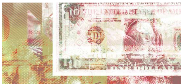
Compromised? The FDA's user fee model has once again come under scrutiny.