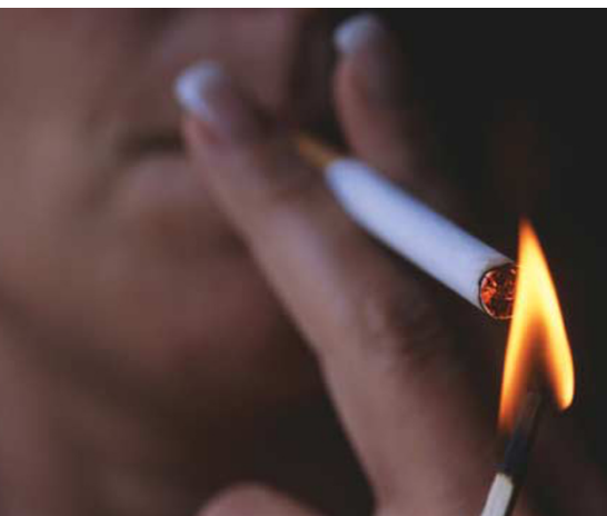
Study could identify how environmental factors such as smoking influence common diseases.