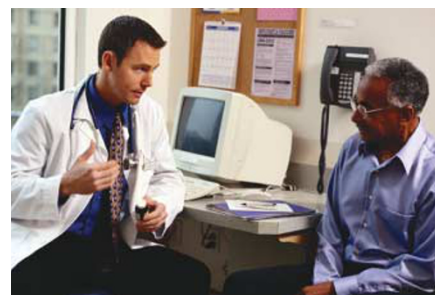
Simvastatin now has OTC status in the UK.