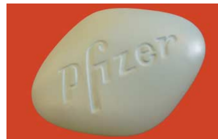
Companies such as Pfizer are introducing customer loyalty schemes for their big sellers.

Loyalty schemes have been slow to reach the drug market because of ethical concerns. But