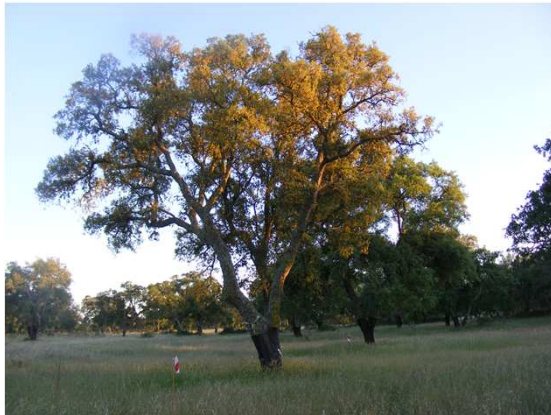
Fig.1 a) Cork oak savanna at Companhia das Lezírias

Spatial variability of soil microbial biomass and activity of cork oak savannas were evaluated in order to understand the contribution of the tree canopy to the soil carbon dynamics of these systems