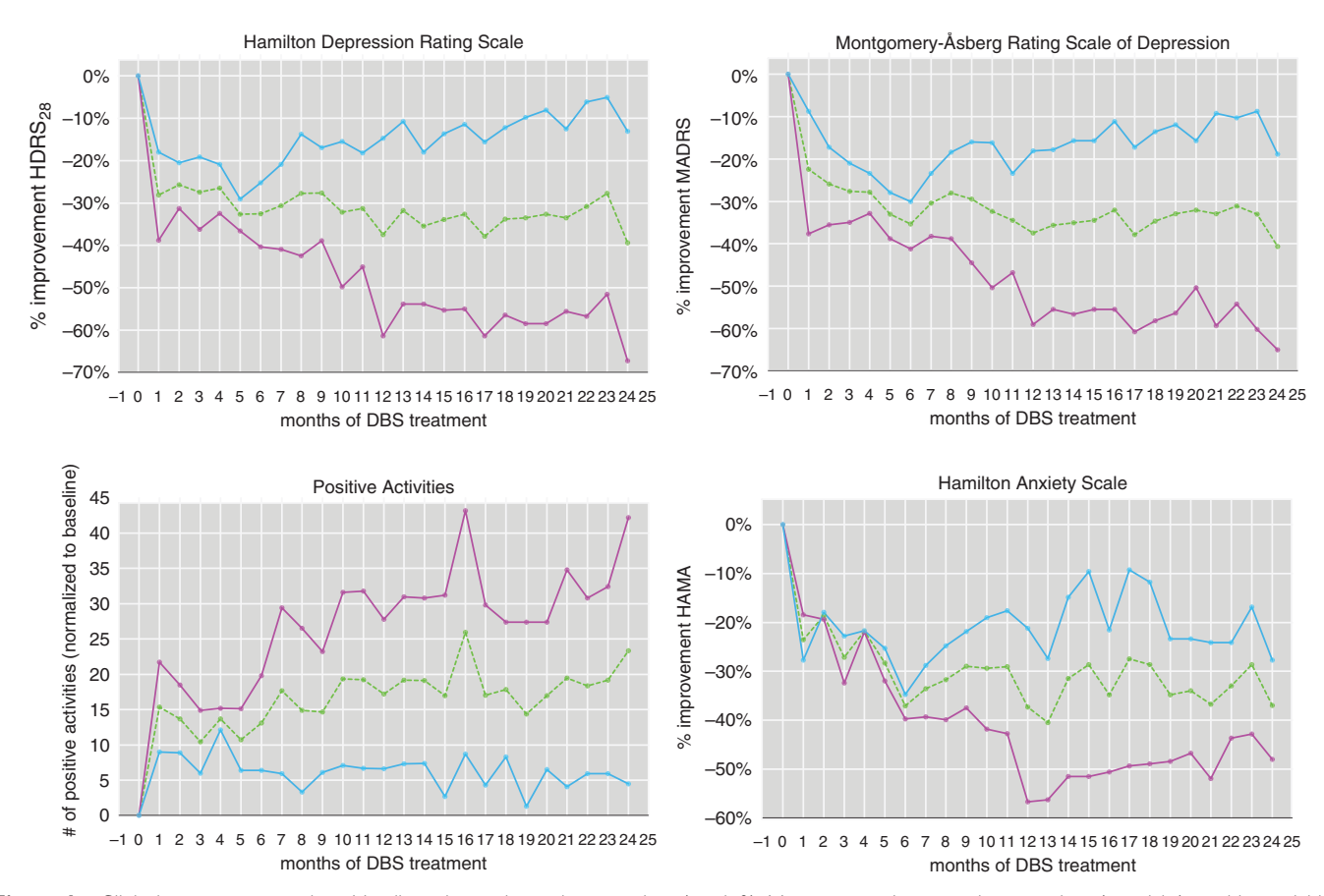
Figure I Clinical outcomes over time. Hamilton depression rating over time (top left); Montgomery-Asperg rating over time (top right); positive activities over time (bottom left); Hamilton anxiety rating over time (bottom right). In red responders (>50% reduction from baseline), in blue non-responders (<50% reduction from baseline), in green group mean scores. For the activities, panel red refers to patients who responded >50% in the HDRS score. At each time point, 11 patients contributed, as data were analyzed in an intent-to-treat method with last observation carried forward.