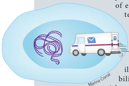
Speedy cargo delivery.