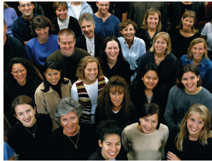
Crowds of people are still superior to computers for many visually based data-analysis tasks.

Crowdsourcing of scientific data analysis partly grew out of distributed computing efforts that harnessed personal computers to create networks whose power rivaled or exceeded that of the most powerful supercomputers. Creation of the Foldit crowdsourcing project, for example, was spurred by users of the distributed computing program Rosetta@home, who wanted to show the software