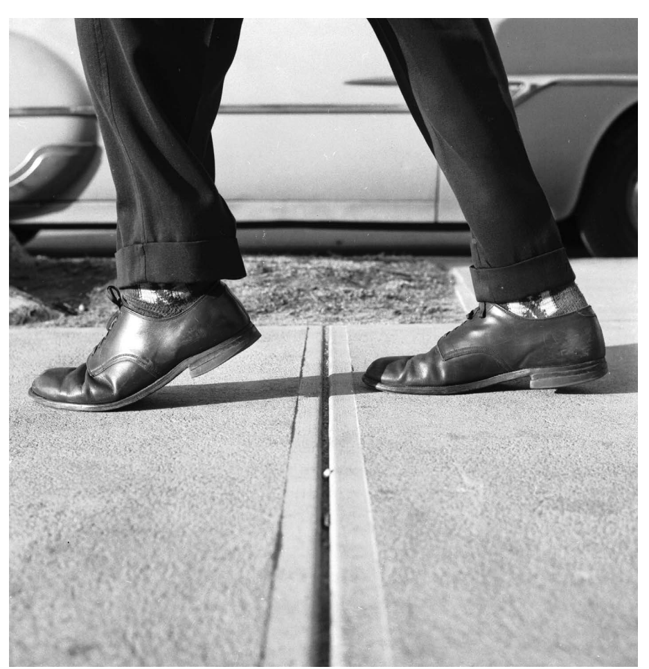
Superstitions reach into every corner of human endeavour - including the science world.

BLOG Personal stories and careers counselling http://blogs.nature.com/naturejobs