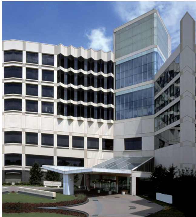
The Simmons Cancer Center in Dallas has benefited from CPRIT funding.