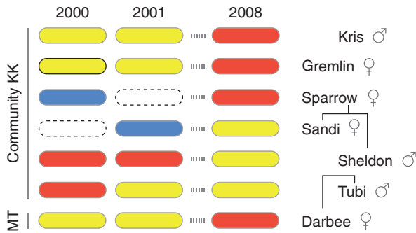
Figure 2 | Chimpanzee enterotypes vary within individuals over time. Enterotype assignments in individual chimpanzee hosts sampled longitudinally in 2000, 2001 and 2008. Samples assigned to enterotype 1 are represented by yellow capsules, samples assigned to enterotype 2 are represented by blue capsules, samples assigned to enterotype 3 are represented by red capsules and empty capsules indicate years when samples for a particular host were not analysed. Hosts are arranged by Gombe community affiliation (MT or KK), with gender and genealogy indicated (such that Sparrow is the mother of Sandi and Sheldon, and Tubi and Darbee are siblings).

As observed in humans, there is no obvious association between chimpanzee enterotype and host genetics or geography. When sampled in 2000, the siblings, Sandi and Shelton, and their mother, Sparrow, each possessed different enterotypes, and their enterotypes changed, and still differed, in later samplings. Meanwhile, three chimpanzees that are not all members of the same family or same geographic community (Darbee, Gremlin and Kris) harboured the same enterotypes at each of the three time points sampled. In humans, diet is likely to be a major contributor to a host's enterotype 2 . As the availability of different foodstuffs in Gombe can fluctuate seasonally 15,16 , diet may also influence the possession of certain chimpanzee enterotypes. However, we found no consistent association between enterotype and the season in which a host was sampled. Furthermore, all three enterotypes were present during each wet season when foods were abundant and the diets among the chimpanzee hosts were the most homogenous.