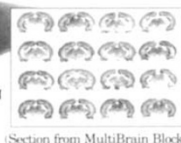
(Section from MultiBrain Block)

Innovative Technology for Leaders in Drug Development