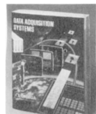
DATA ACQUISITION SYSTEMS

Data Acquisition and Computer Interface Handbook . Omega Engineering's (Stamford, CT) full-color, 350-page publication describes products ranging from software to complete data handling systems.