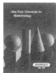
Ultra Pure Chemicals for Biotechnology

Ultra Pure Chemicals for Biotechnology , available from Amresco (Solon, OH), lists over 300 specialty chemicals, among them the company's new Amresco®Gel