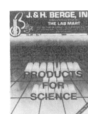
J. & H. BERGE, INC. THE LAB MART PRODUCTS FOR SCIENCE

Products for Science is J. & H. Berge's (South Plainfield, NJ) new 96-page listing of general laboratory products. Full technical specifications are given for equipment such as balances, baths, incubators, plasticware, meters, and pipetting aids.