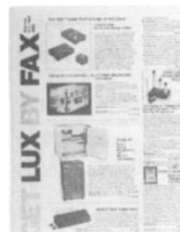
LUX BY FAX

Lux Scientific Instrument Corp. (New York, NY) presents 50 laboratory and office products in its new 8-page brochure. Among the offerings: