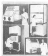
Personnel and Product Protection: A Guide to Laboratory Equipment

Labconco (Kansas City, MO) offers Personnel and Product Protection: A Guide to Laboratory Equipment , designed to help researchers choose appropriate protective equipment for various situations.