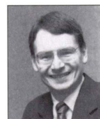
then president and CEO, of Astra Merck Inc.