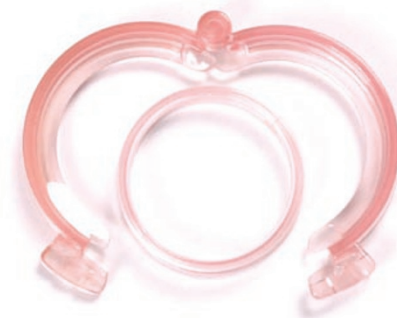
This Chinese device, a ShangRing, holds the foreskin in place, allowing it to be snipped away quickly with no stitches required.

Some researchers are devising ways to make these methods easier to use. For example, a