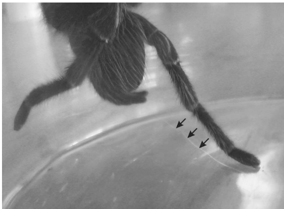
Figure 1 | The zebra tarantula Aphonopelma seemanni entangling a silk thread released from the spinneret with its hind leg, while starting to climb a vertical glass wall. Arrows indicate the silk thread.

Tarantulas entangle silk threads from the spinnerets with their tarsi (Fig. 1). They often use hind legs to entangle silk, but we also observed