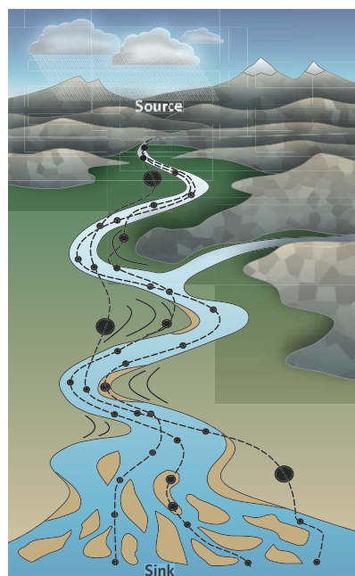
Figure 1 | The concept of a sediment-routing system. Sediment is transferred from a source region to a sink along trajectories shown by the dashed lines. Some trajectories involve short transit times with brief periods of storage in the sediment-routing system (small circles) (for example, on the river-channel bed), whereas others involve long transit times with prolonged periods of storage (large circles) (for example, in bars and flood plains). Storage of sediment implies buffering of incoming sediment flux signals.

It is not immediately obvious that the factors controlling a long-term response may be different from those controlling local processes. To