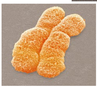
Figure 1 Inset: coloured scanning electron micrograph of a pair of human chromosomes. Main image: scanning tunnelling micrograph showing approximately three turns of a DNA double helix. The image is created by scanning a fine point just above the surface of a DNA molecule and electronically recording the height of the point as it moves across the specimen.

And don't think that this will, on closer inspection, turn out to be woven from that elegant, pristine double helix. Rather, the threads are chromatin — a filamentary assembly of DNA and proteins — in which only very short stretches of the naked helix are fleetingly revealed. Although chromosomes are often equated with DNA, there is actually about twice as much protein as DNA in chromatin. And about 10 per cent of the mass of a chromosome is made up of RNA chains, newly formed (or in