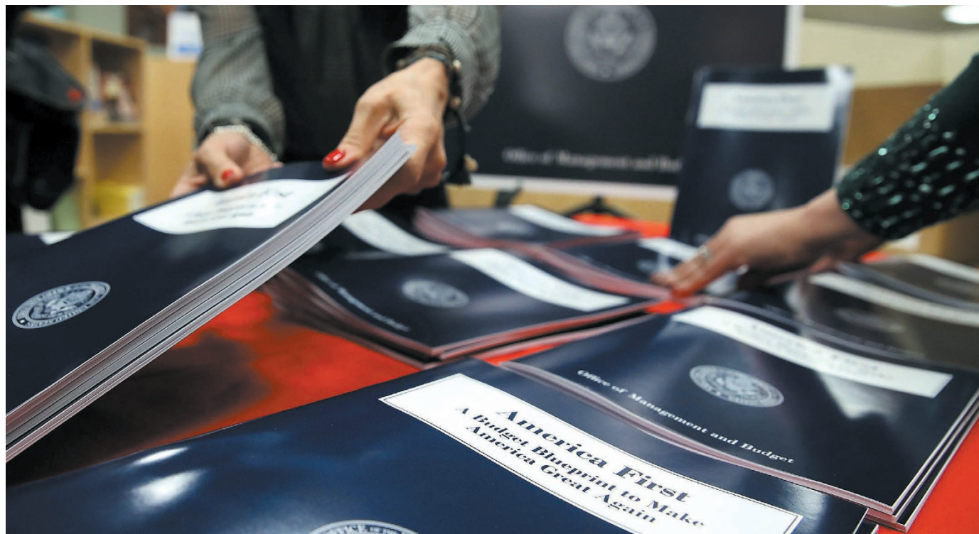
The US president is pushing for deep budget cuts that would affect a broad range of research activities, from climate science to cancer biology.