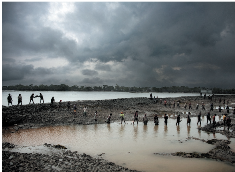
Flood barriers in Bangladesh could find support from a United Nations climate fund.

In the world of climate finance, the GCF is a tiny player. If funding for renewable energy and energy-efficiency programmes