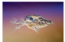
Tapeworms battle it out to control shared host

Tapeworm-derived tumours are extremely rare, says Olson, who has documented a handful of other cases in