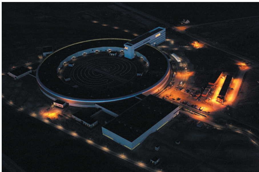
The next-generation synchrotron at Lund in Sweden has passed its first test.