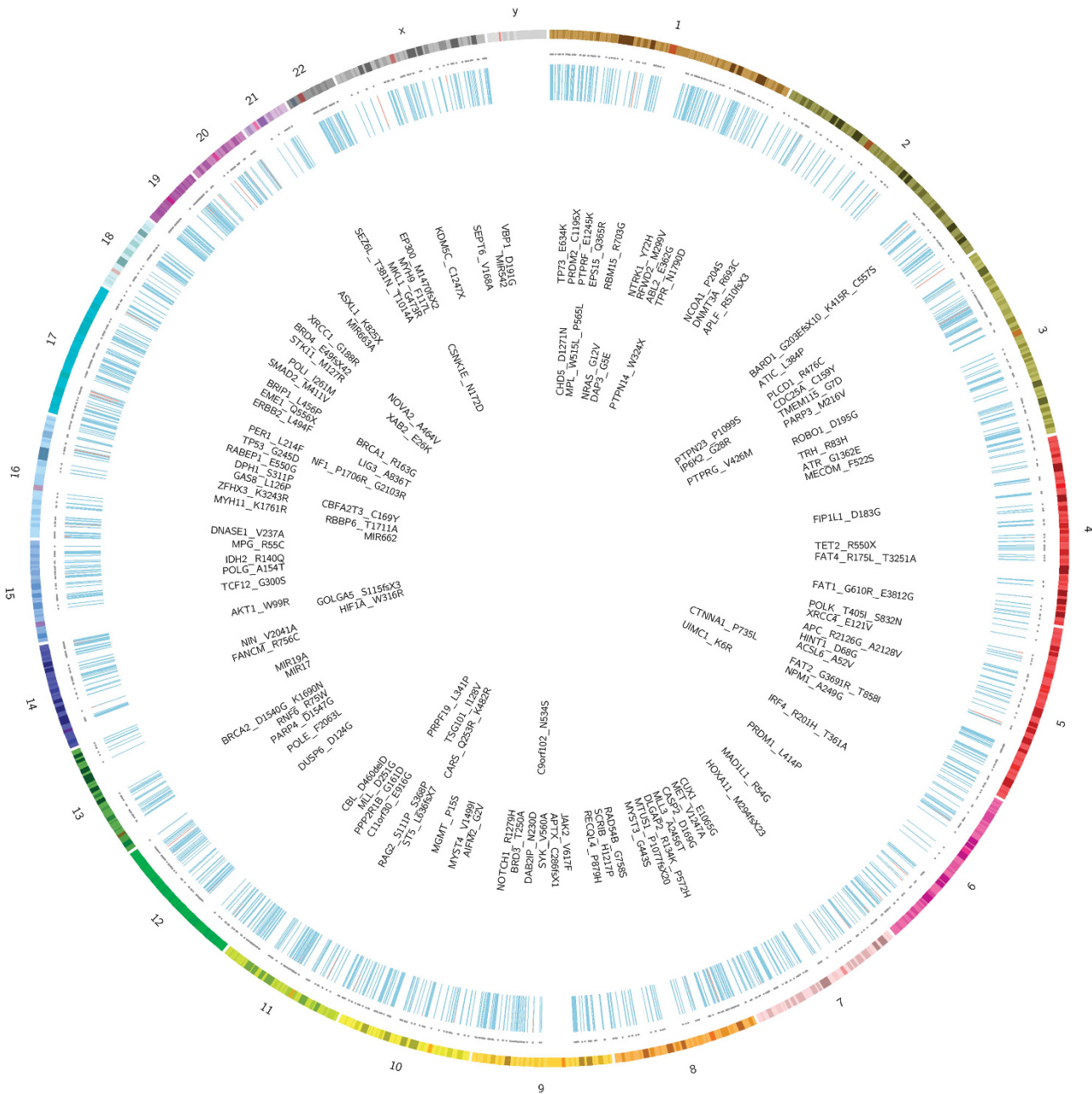
Figure 2. Circular diagram of mutations found in MPN. Chromosomes are illustrated in the outer perimeter. Grey dots show the ‘cancer exome’ regions of the NimbleGen panel, whereas the histograms show the captured (blue) and failed (red) target regions. MicroRNA or Gene Symbol with amino acidic change refers to the variants found in our cohort.

In addition, 8 genes ( SCRIB , MIR662 , BARD1 , TCF12 , FAT4 , DAP3 , POLG and NRAS ) appeared as recurrently mutated in the cohort, some of which ( SCRIB 7.9%, MIR662 7.4% and BARD1 5.3%) were more frequently mutated than previously identified, well-known mutational hotspots 18 (Table 4).